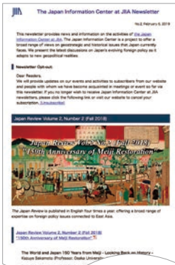
The Japan Information Center at JIIA Newsletter

The Japan Information Center at JIIA Newsletter provides news and information on the activities of the Japan Information Center at JIIA.