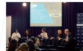
Symposium in London on Feb. 25, 2019

JIIA has co-hosted symposia on geostrategic and historical issues with thinktanks and academic institutions. The following are some of the events that JIIA organized under the Japan Information Center Program: