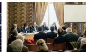
Symposium in Paris on Jan. 28, 2019