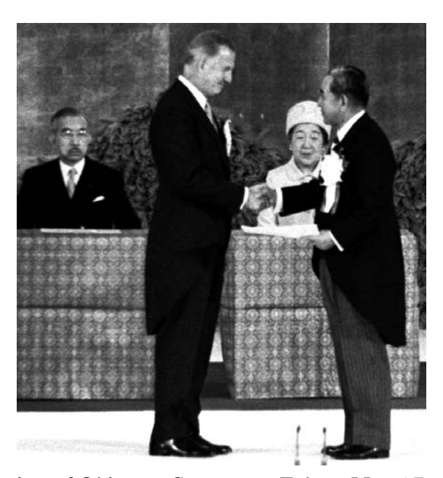
Reversion of Okinawa Ceremony, Tokyo, May 15, 1972

As part of the revised bilateral security treaty, signed in January 1960 and going into effect in June that year, as well as the related Status of Forces Agreement (which also went into effect at