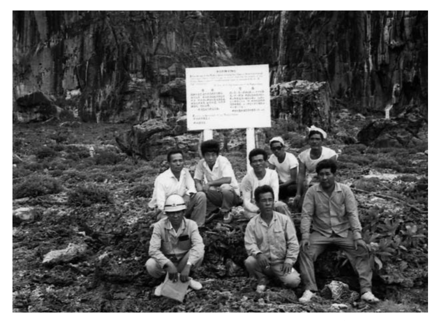
The Installment of the No-trespassing Sign

On a slightly related note, in the late 1960s, after Taiwanese fishermen had illegally landed in the Senkakus, the Government of the Ryukyu Islands put up "no trespassing" signs at the suggestion of USCAR. (Denying access to areas is an important aspect to show ownership of land or property, and an important concept in real estate.) These signs were finally installed in July 1970, including on Kuba Island and Taishō Island.<sup>23</sup>