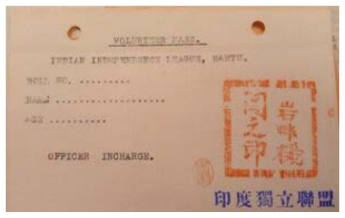
A "Volunteer Pass" issued by the Indian Independence League; (World War II Records from Burma, 1938–1945) Southeast Asian Rare Book Collection, Library of Congress, Asian Division

Rash Behari Bose saw the utility of the Indian Independence League and the Indian National Army in their role as a great source of moral support for the freedom movement within India. The large number of compatriots in Southeast Asia served as a source of powerful inspiration to the freedom fighters residing in British India at that time. Under the leadership of Rash Behari Bose, the League secured the Japanese government's undertaking that no Indian Army personnel would be required to do manual labor like other POWs, which was considered no mean achievement. The enlistment of public opinion strongly in India's favor throughout Southeast Asia was one of the Indian Independence League's greatest achievements. 46